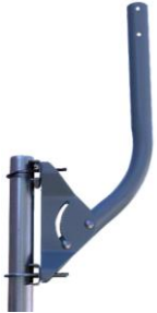
UM-UB U-Bolt Kit

The UM/L universal antenna mounting systems consist of a universal bracket and choice of 2 different length mounting tube for the most demanding customer premises antenna mounting applications. The construction is better than many of these type of mounts which are only light gauge painted steel. Laird Connectivity's mounts are heavy gauge steel which goes through a galvanization (plating) process and then are powder coat painted for extra protection from the elements. Fasteners used are stainless steel. The mounting tubes have 2 sets of holes to give maximum angular flexibility during installations. The mounting systems feature a universal mounting bracket with a full 90 degrees of tilt which allows for greater versatility when dealing with the variety of installation challenges found at customer sites. Their low profile and attractive styling make it ideal for installations on various styles of buildings and in all neighborhoods, including upscale neighborhoods.