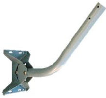
UM Universal Mount