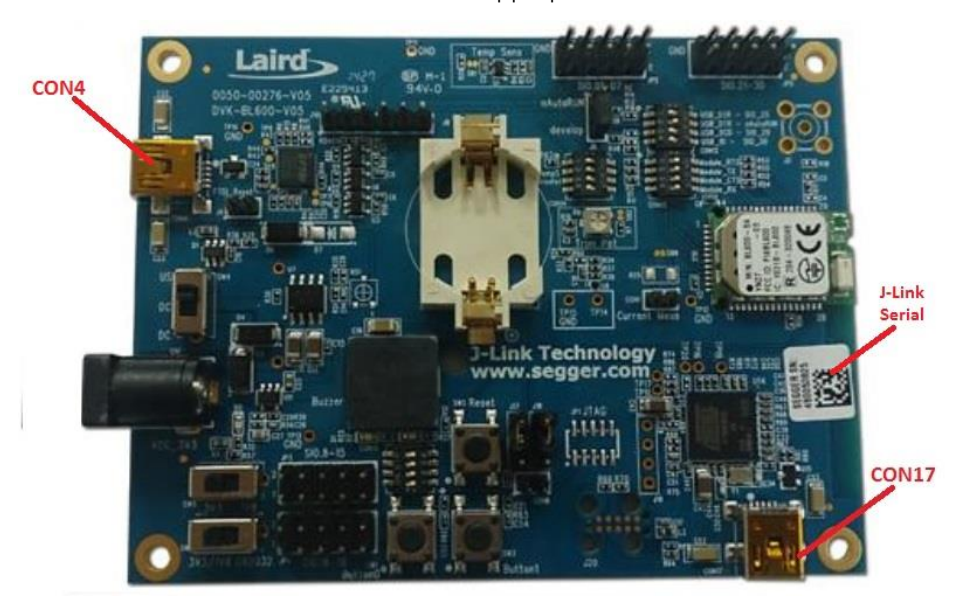
Figure 1: BL600 development board

BL600 Dev Kit DVK-BL600-Sx-05 and an appropriate USB cable