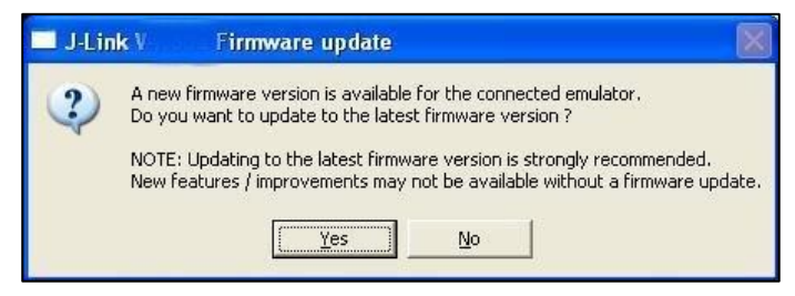
Figure 4: J-Link firmware update dialog

6. Click Yes to update the J-Link firmware.