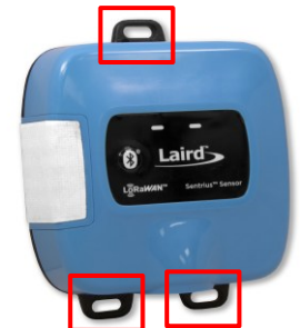
Figure 4: Front side of the Sentrius™ RS1xx Sensor