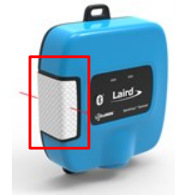
Figure 5: Front side of the Sentrius™ RS1xx Sensor