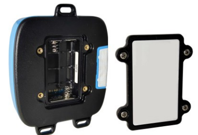
Figure 3: Back side of the Sentrius™ RS1xx Sensor