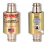
Lightning Arrestor LABH350NN (Sold Separately)