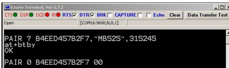
Figure 2: Simple Secure Pairing prompt

Initiate a search for the BTM511 from your mobile phone's Bluetooth settings screen. If your source device supports Bluetooth 2.1 (most modern phones do) it may try to use simple secure pairing, in which case you will receive a prompt on both the source device and from the BTM511 (Figure 2). In the screenshot below "PAIR?" indicates an incoming pairing request, "B4EED457B2F7" is the Bluetooth address of the source device, "MB525" is its friendly name and "315245" the random six digit number displayed on both devices. Accept the pairing on the source device and then accept the pairing on the BTM511 by sending "at+btby".