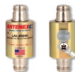
Lightning Arrestor LABH350NN (Sold Separately)